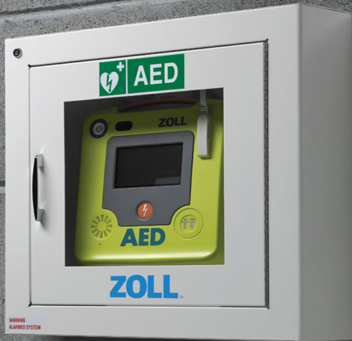
Standard Surface-mounted Wall Cabinet Part# 8000-001256 17.5 inches x 17.5 inches x 7 inches (45.5 cm x 45.5 cm x 17.8 cm)